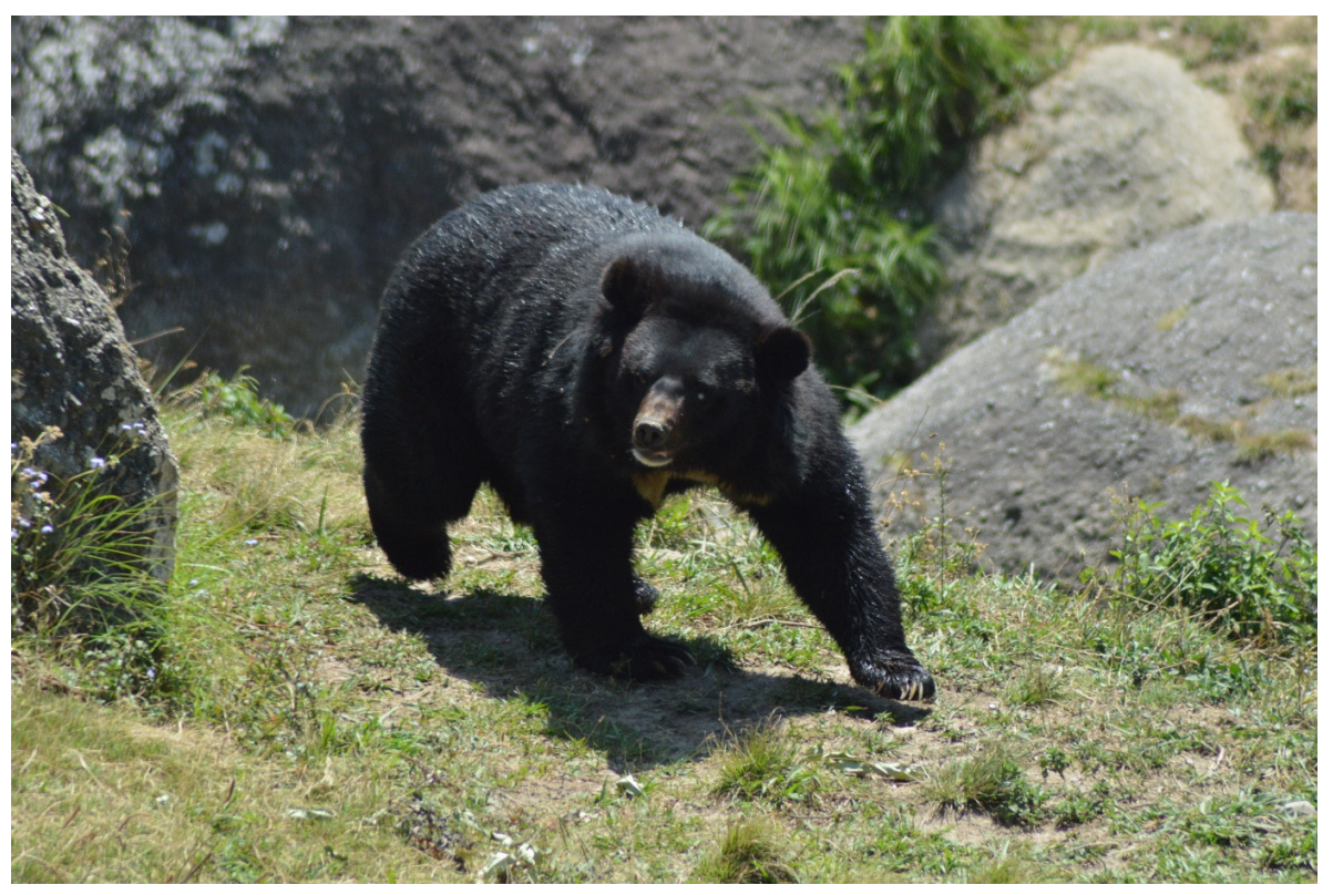
HIMALAYAN BLACK BEAR